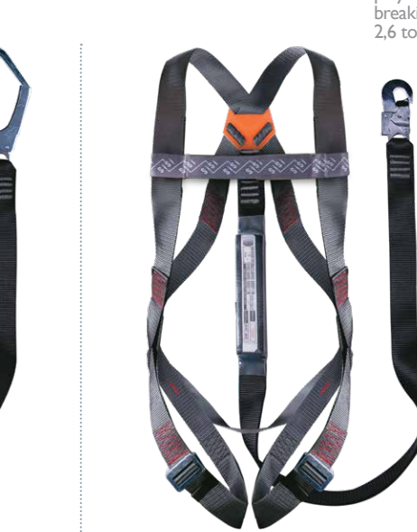
45mm UV-resistant polyester, minimum breaking load of 2,6 tonnes