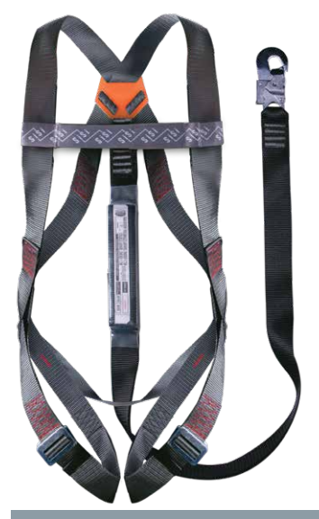
Buckles: Interlocking, corrosionresistant steel buckles