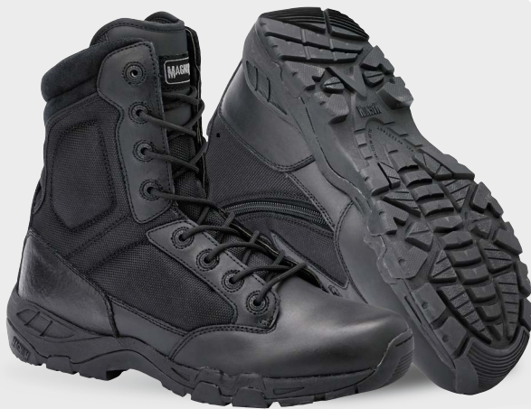
VIPER PRO 8" SZ CT WIDE