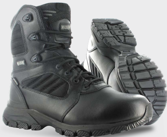
LYNX 8.0 SZ