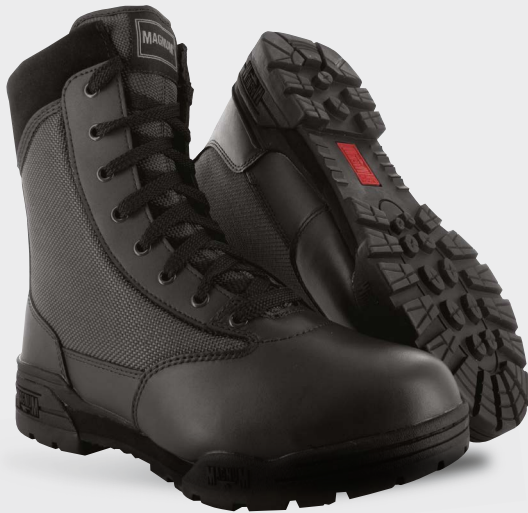
MAGNUM CLASSIC BLACK