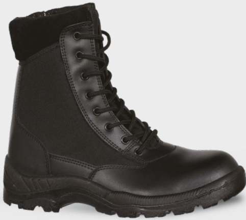
ULINDA SECURITY BOOT