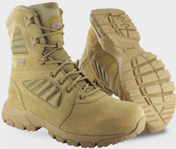
LYNX 8.0 SZ