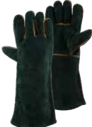
LEATHER GLOVES GREEN LINED WELDERS ELBOW LENGTH GLOVES