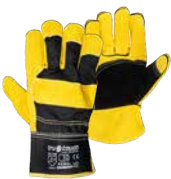
LEATHER GLOVES CHROME LEATHER YELLOW CANDY SUPERIOR WRIST GLOVES