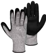
DIPPED GLOVES CUT 5 NITRILE GLOVES

SIZE 7/S, 8/M, 9/L, 10/XL CODE GL-CUT5WRNI