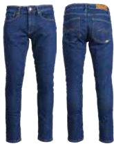
REBEL APPAREL WORK WEAR MEN'S JEANS – DARK BLUE