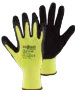
DIPPED GLOVES HI VIZ SANDY NITRILE GLOVES

SIZE 7/S, 8/M, 9/L, 10/XL CODE GL-NITBLSAWR