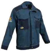
REBEL APPAREL TECH GEAR ACID FLAME JACKET