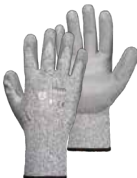
DIPPED GLOVES CUT 5 PU GLOVES

SIZE 7/S, 8/M, 9/L, 10/XL CODE GL-CUT5WRPU