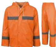
COLD & RAIN PROTECTION RUBBERISED HI VIZ REFLECTIVE ORANGE RAIN SUIT