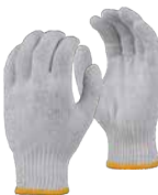
DIPPED GLOVES COTTON LINER GLOVES

SIZE 7/S, 8/M, 9/L, 10/XL CODE GL-CUT5WRNI