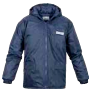
COLD & RAIN PROTECTION THERMOSKIN LITE FREEZER JACKET