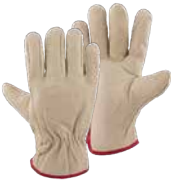
LEATHER GLOVES TIG FULL GRAIN LEATHER GLOVES