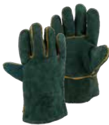
LEATHER GLOVES GREEN LINED WELDERS WRIST LENGTH GLOVES