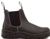
CODE FX2-CB-S1P | SIZES 3-13 FX2 CHELSEA BOOT