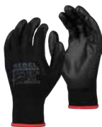
DIPPED GLOVES BLACK PU COATED GENERAL HANDLING GLOVES