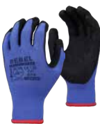
DIPPED GLOVES BLUE SANDY NITRILE GLOVES

SIZE 7/S, 8/M, 9/L, 10/XL CODE GL-NITBLSAWR