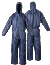
COLD & RAIN PROTECTION THERMOSKIN FREEZER SUIT