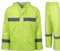
COLD & RAIN PROTECTION RUBBERISED HI VIZ REFLECTIVE LIME RAIN SUIT