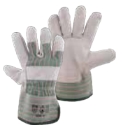
LEATHER GLOVES CHROME LEATHER CANDY STANDARD GLOVES