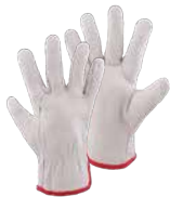
LEATHER GLOVES GOAT SKIN VIP DRIVER GLOVES