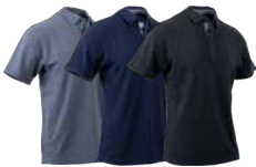
REBEL APPAREL WORK WEAR GOLF SHIRT

WW-TSBRE ■ WW-TSNRE ■ WW-TSORE ■ WW-TSRBRE ■