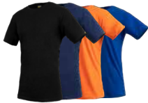
REBEL APPAREL WORK WEAR T-SHIRT