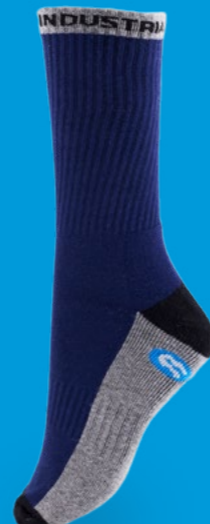
WORK SOCKS Navy/Black 900-9601 › Size range: 5-14