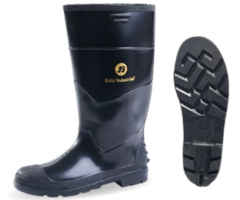
JOBBER Black 892-6626 › Size range: 5-12