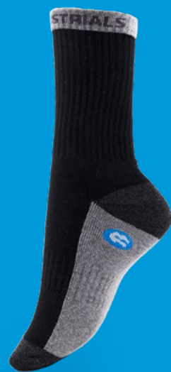
WORK SOCKS Charcoal/Grey 900-2601 › Size range: 5-14