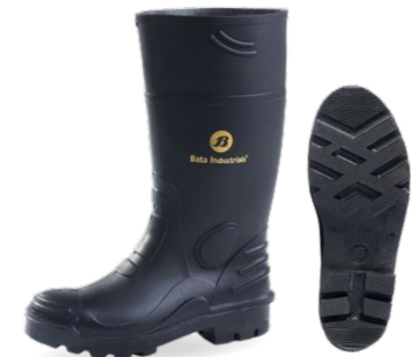
RHINO 3 Black 892-6621 › Size range: 5-12