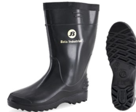
ELEGANT Black 592-6627 › Size range: 3-9