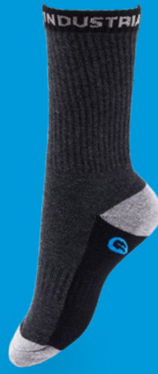
WORK SOCKS Black/Charcoal 900-6201 › Size range: 5-14