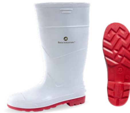
JOBBER White/Red 892-1525 › Size range: 5-12