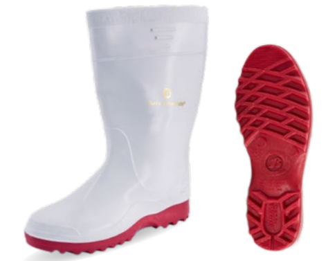
ELEGANT White/Red 592-1527 › Size range: 3-9