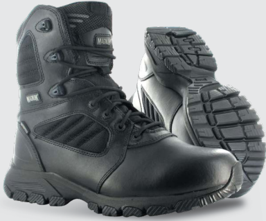
LYNX 8.0 SZ