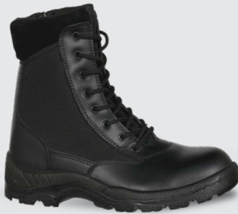
ULINDA SECURITY BOOT