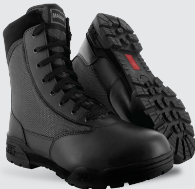
MAGNUM CLASSIC BLACK