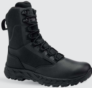
CLASSIC II 8.0 SZ