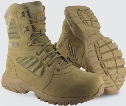
LYNX 8.0 SZ