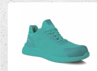
GLIDE AQUA Style Code: JCB1845