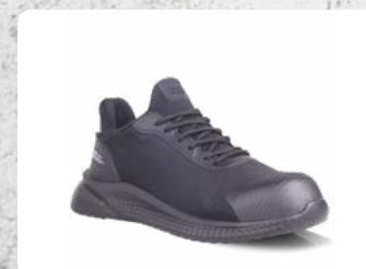
GLIDE BLACK Style Code: JCB1815