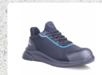
GLIDE SKY Style Code: JCB1835