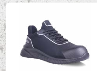
GLIDE REFLECT SILVER Style Code: JCB1825